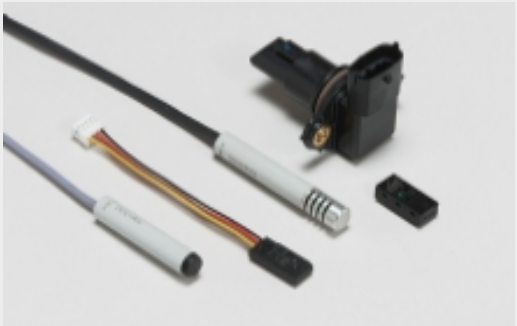
Humidity Sensor Assemblies(4)

Download the HTU20D Generic C driver from Github.