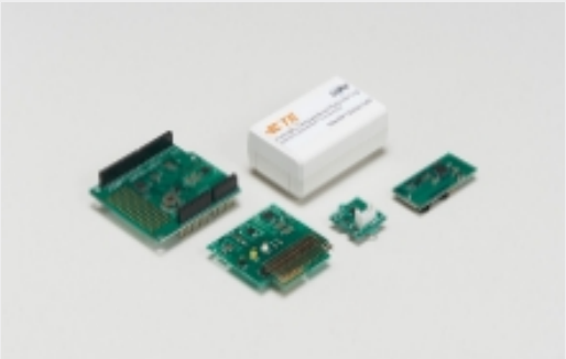
Sensor Development Boards and Evaluation Kits(3)