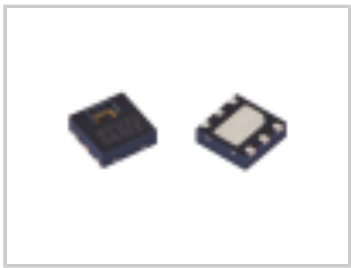
HTU20DF RH/T SENSOR W. FILTER