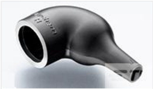
TE Part #CV7366-000 222K121-25L-0