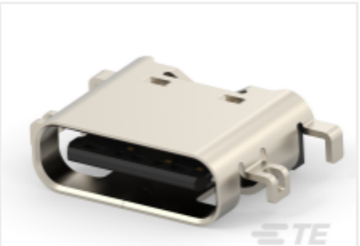
TE Part #2480843-1 USB C Charge-only,6 Pin, Mid, 3u GF