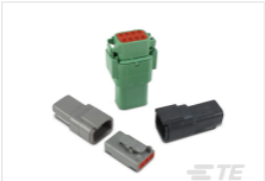
TE Part #CAT-D485-CH8172 DEUTSCH DTM Housings