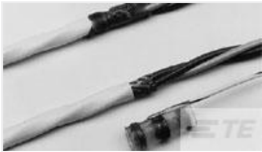
TE Part #744861-000 S02-12-R

Product Drawings 44A1231-14-MST3-9CS3030