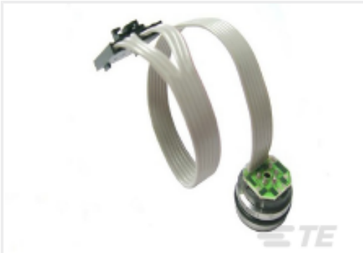
TE Part #86-300G-RT 300 PSIG MV VENT TUBE PRESSURE SENSOR