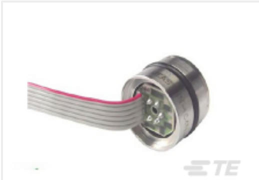
TE Part #CAT-MIPS0002 19MM MV OUTPUT PRESSURE SENSOR