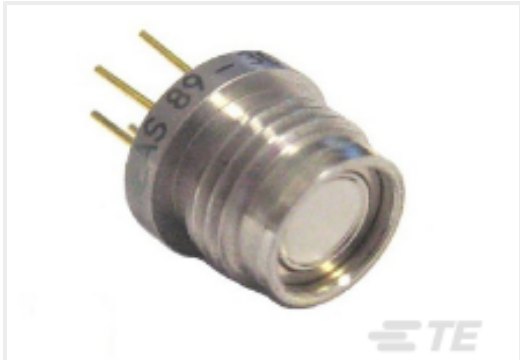
TE Part #89-05KA-0U 5K PSIA 316L MV PRESSURE SENSOR