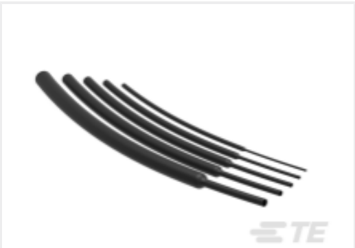
TE Part #NB19914001 VERSAFIT-1/16-0-SP