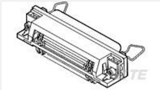
TE Part #5555149-1 RCPT ASSY,LPF,RTANG,50 POSN