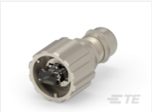
TE Part #2362760-1 IDC PLUG, Die Cast