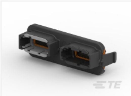
TE Part #DTM1312PA12PBR008 HDR, 24P, BLK, RA EEC, NI/CU, AB