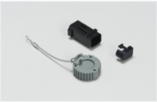
Automotive Connector Caps & Covers (7)