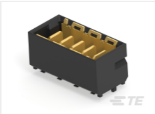
TE Part #214550-E MSPPM 5 M SMD M2 * A V 137 094 * E008 J