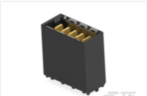
TE Part #214552-E MSPPM 5 M SMD M10 * A V 137 094 * E008 J