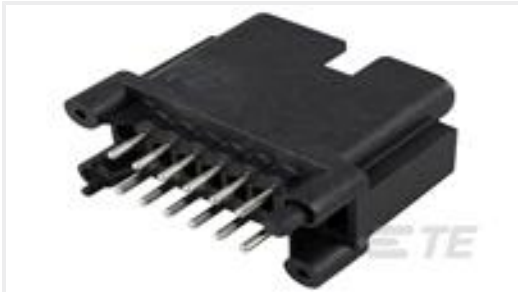
TE Part #DTF15-12PB HDR, 12P, BLK, ST, SN/NI/CU, B