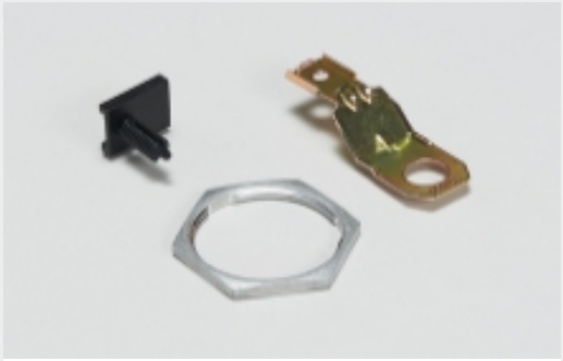
Other Automotive Connector Accessories(7)