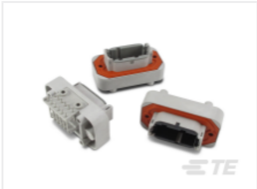
TE Part #CAT-D485-H342 DEUTSCH DTM Headers