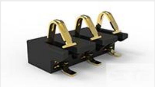
TE Part #292448-1 3.0mm PITCH 3P SMT ASSEMBLY BATTERY CONN