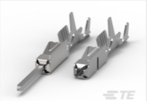
TE Part #CAT-M8793-T273 MQS, RECEPTACLE AND TAB