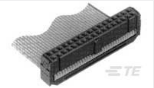
TE Part #1658622-9 40 NOVO MIL/CTR 30DP,LEAD FREE