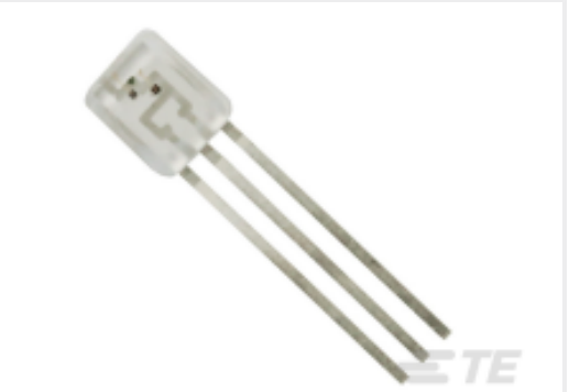
TE Part #ELM-4001 EMITTER ASSEMBLY