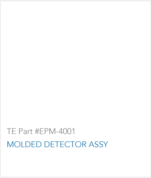
TE Part #EPM-4001 MOLDED DETECTOR ASSY