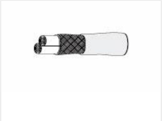
TE Part #868725-000 55A1112-24-9-9CS2275