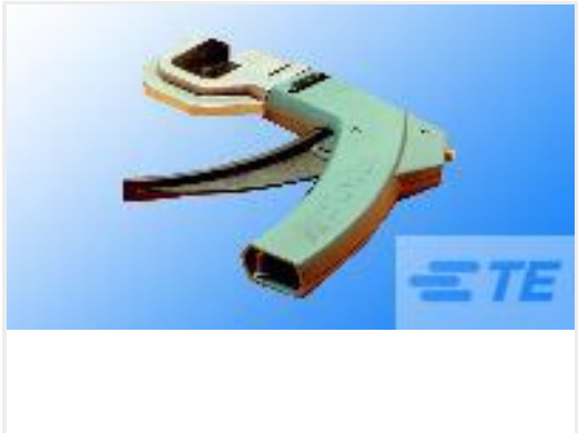
TE Part #608868-1 HDE HT PKG FOR SUB D