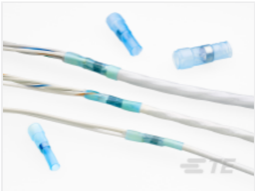
TE Part #EM7793-000 S01-6-R