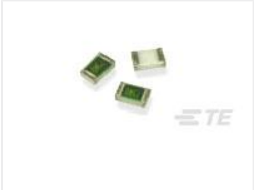
TE Part #2-1614350-8 RN 0603 13K3 0.1% 10PPM CUT LE