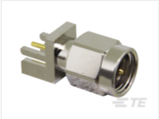
TE Part #L9000273-01 SMA Plug 50 Ohm .031 PCB Edge Mount