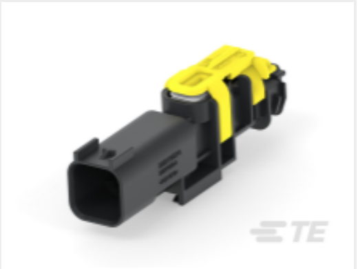
TE Part #2354957-1 Matenet Sealed Inliner Assy, Code A