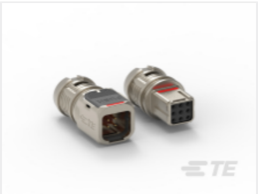
TE Part #YD369-MP66-NS10000 369 6 WAY SHIELDED PLUG, CRIMP, SKT