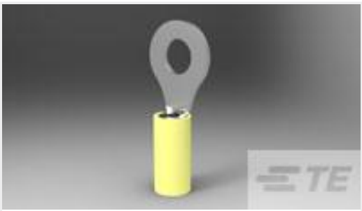
TE Part #8-35345-2 TERMINAL,PIDG R 12-10 1/4