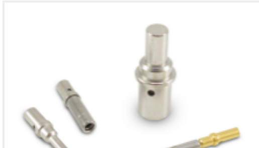
TE Part #CAT-D48-ST273 DEUTSCH Solid Contacts