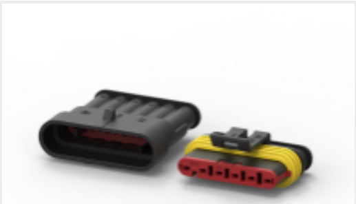
TE Part #CAT-AM71-CH8172 AMP SUPERSEAL 1.5MM, CONNECTOR HOUSING