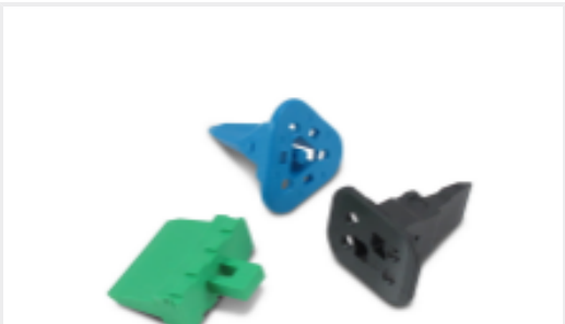
TE Part #CAT-D487-W416 Wedge locks: DEUTSCH DT