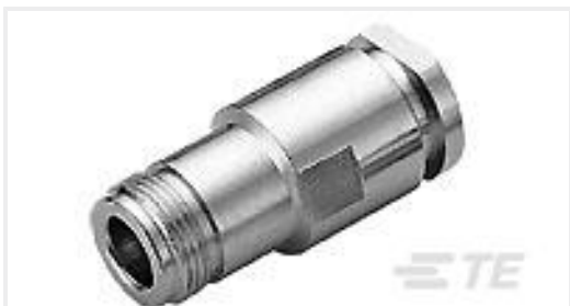
TE Part #1-1337406-0 N Str Jk PS 50Ohm Silver Pltd PSF 1 /4M,