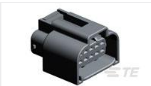
TE Part #1897726-2 MCP 1.5 SLD 10P PLUG ASS'Y