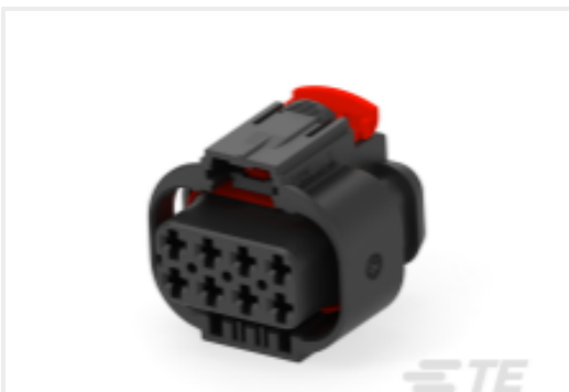
TE Part #2109441-2 MCP 2.8 8P PLUG ASSY BLK/A