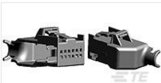
TE Part #1-1534096-1 MQS ABDECKKAPPE2X6P