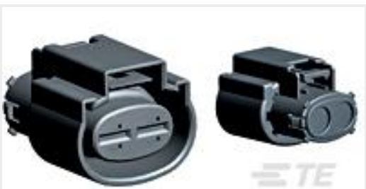
TE Part #1897214-1 MCP 6.3 2P PLUG ASSY