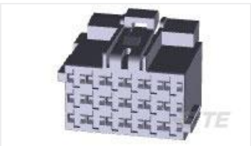
TE Part #3-967624-1 JUN-POW-TIM GEH 18P