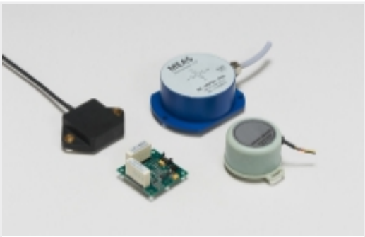
Tilt Sensors & Inclinometers(2)