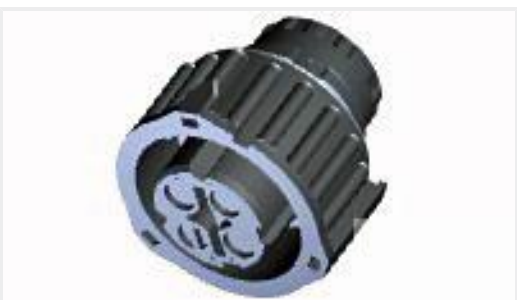
TE Part #5-1813099-2 2.5mm SOCKET HSG ASSEMBLY (BLACK 3 POS)