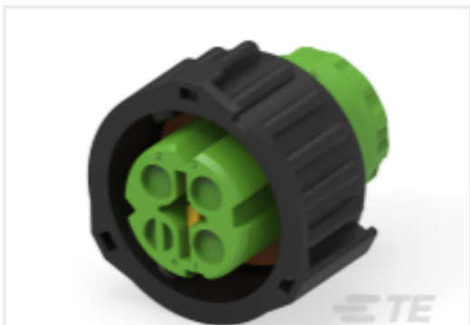
TE Part #3-1813099-2 2.5mm SOCKET HSG ASSEMBLY (GREEN 3POS)