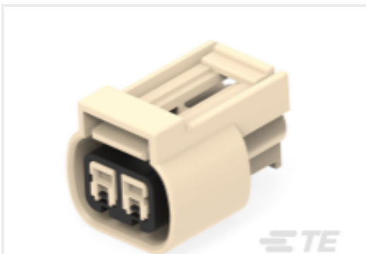
TE Part #936184-1 BULB CONN 2P PLUG ASSY IVORY