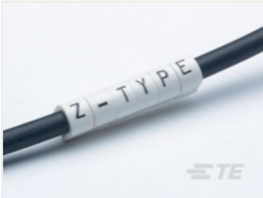
TE Part #EC0036-000 05801505