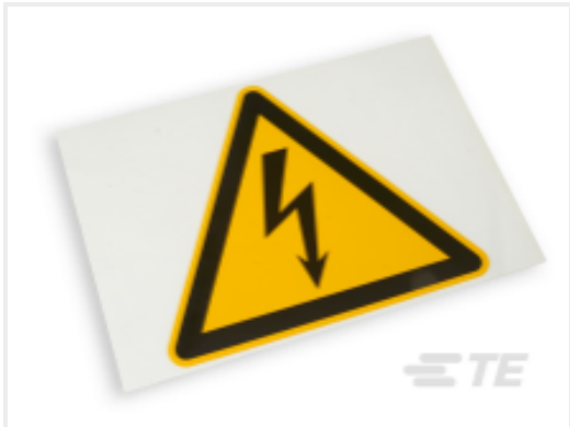
TE Part #1768020-3 ESSW19-074