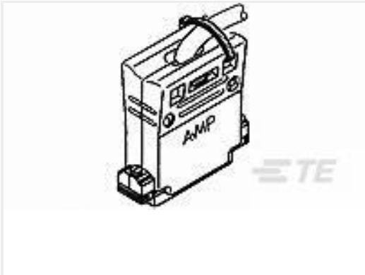
TE Part #5745134-1 CABLE CLAMP KIT,SZ 3