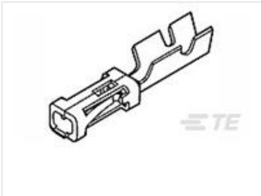
TE Part #86016-1 MOD IV RECP LP