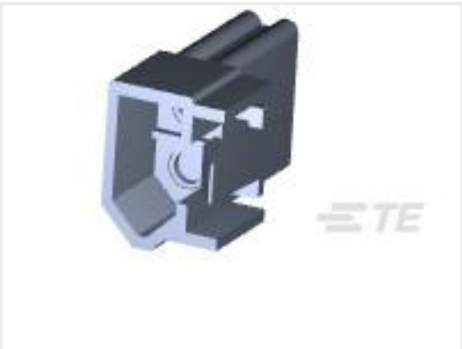
TE Part #770425-1 02P .093 COMM P&S PLUG .248CL