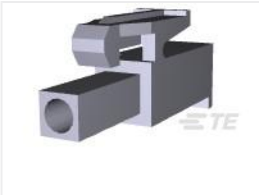
TE Part #172164-1 1 CIR UNIV M-N-L PLUG