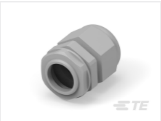
TE Part #1478768-5 ANTI-VIB NYLON GLD 25MM GREY