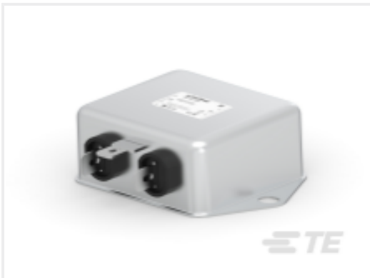
TE Part #802430-SF FN2030-6-06