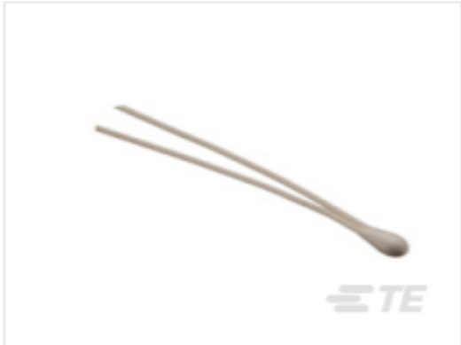
TE Part #GA30K5A1IA DISCRETE 30K OHMS,+/-0.1C FROM 0C TO 70C