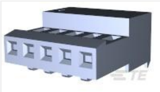
TE Part #3-640442-5 05P MTA100 CONN ASSY BLU