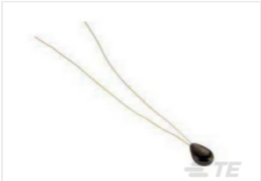
TE Part #CAT-NTC0071 Super Stable Glass Thermistors - 46000