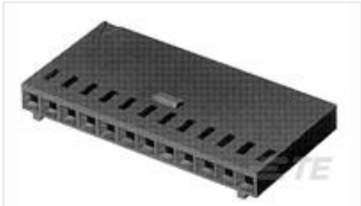
TE Part #102241-1 03 MODIV HSG COMP SR .100 POL