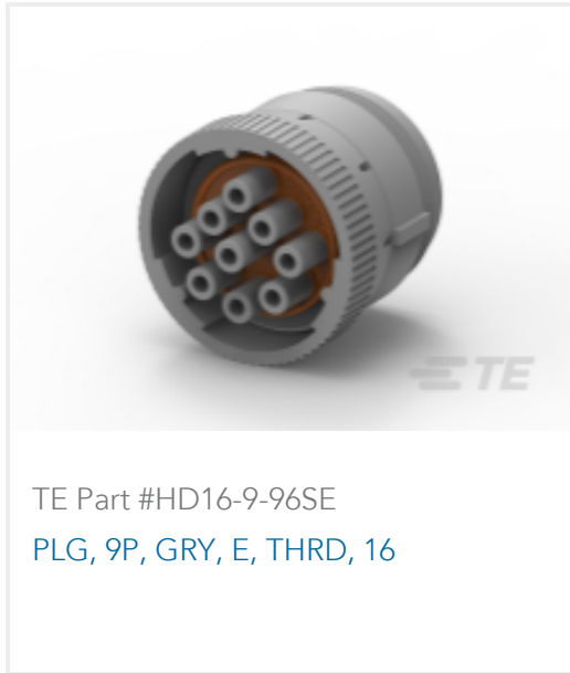
TE Part #HD16-9-96SE PLG, 9P, GRY, E, THRD, 16