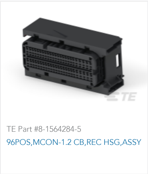
TE Part #8-1564284-5 96POS,MCON-1.2 CB,REC HSG,ASSY