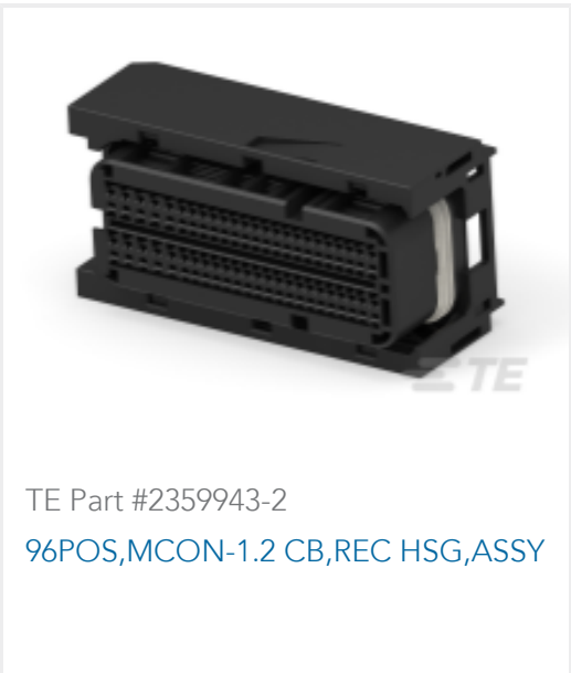
TE Part #2359943-2 96POS,MCON-1.2 CB,REC HSG,ASSY