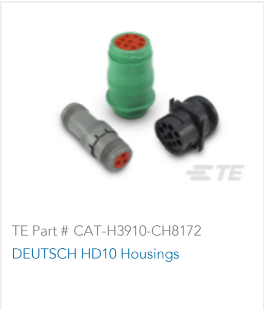
TE Part # CAT-H3910-CH8172 DEUTSCH HD10 Housings