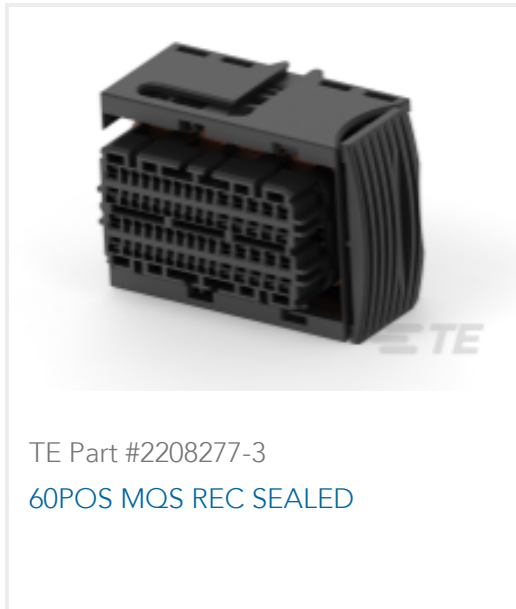
TE Part #2208277-3 60POS MQS REC SEALED