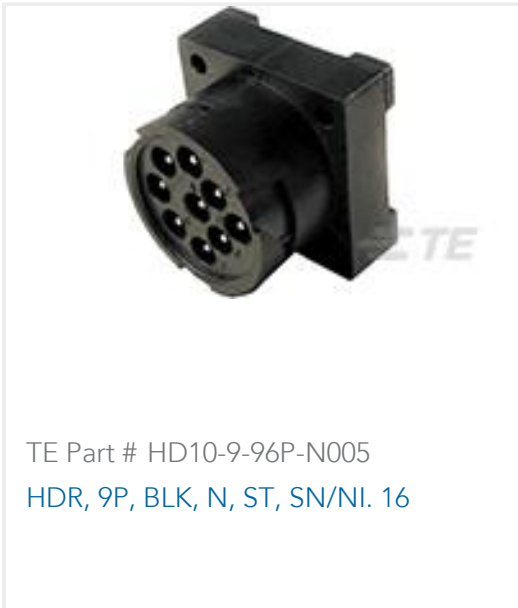
TE Part # HD10-9-96P-N005 HDR, 9P, BLK, N, ST, SN/NI. 16