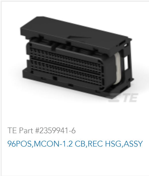
TE Part #2359941-6 96POS,MCON-1.2 CB,REC HSG,ASSY