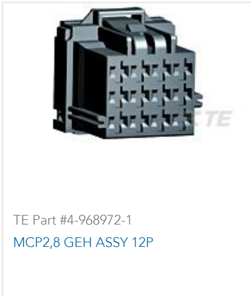
TE Part #4-968972-1 MCP2,8 GEH ASSY 12P