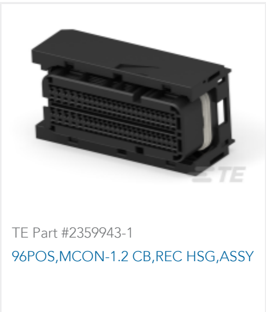
TE Part #2359943-1 96POS,MCON-1.2 CB,REC HSG,ASSY