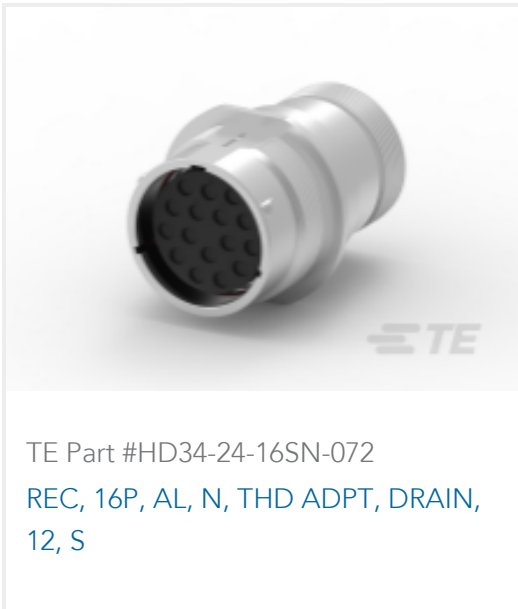
TE Part #HD34-24-16SN-072 REC, 16P, AL, N, THD ADPT, DRAIN, 12, S