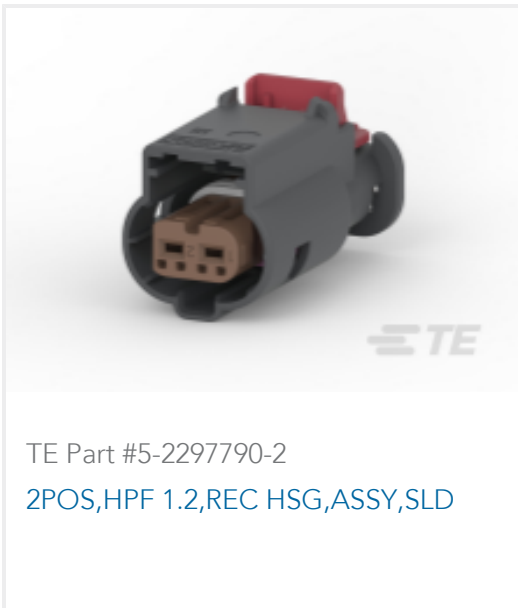
TE Part #5-2297790-2 2POS,HPF 1.2,REC HSG,ASSY,SLD