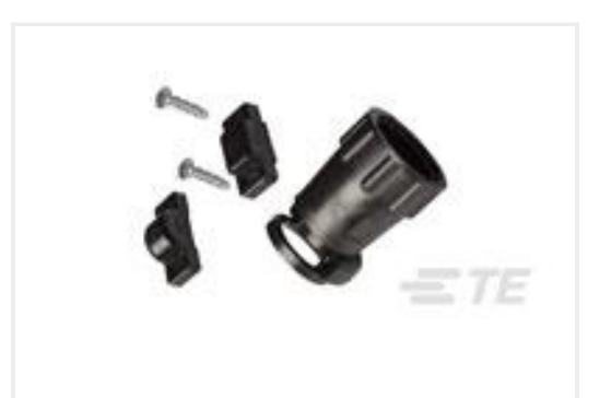
TE Part #206966-7 CABLE SHELL CLAMP SIZE 13