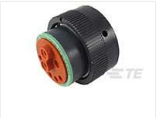
TE Part #HDP26-24-91SN-P064 PLG, 9P, BLK, N, NO JMP, 8/12/16, S