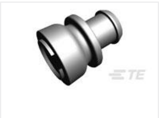
TE Part #828922-1 2,5MM CAVITY PLUG FOR 5,4MM DI