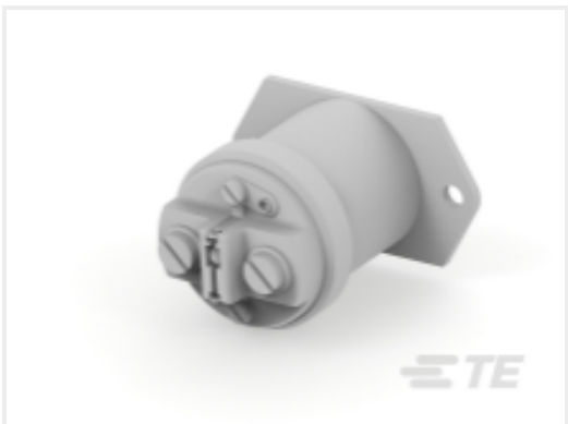
TE Part #K1008006 Relay 26-71-01