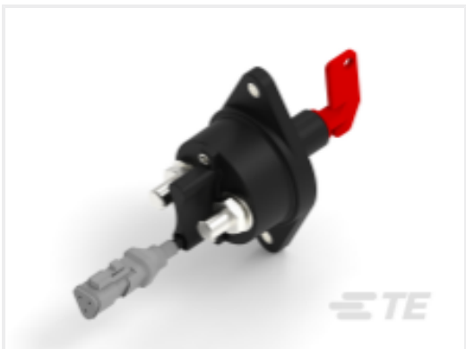
TE Part #CAT-AL4-SBD355001 Battery Disconnecter, 500A, 1 Pole