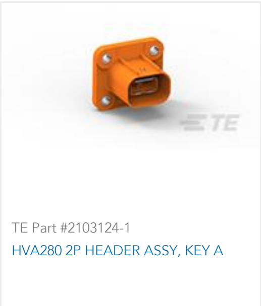
TE Part #2103124-1 HVA280 2P HEADER ASSY, KEY A