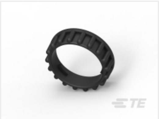
TE Part #965687-1 FIXING RING