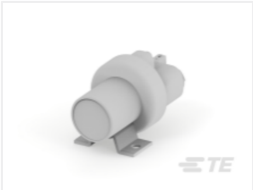
TE Part #K1014846 Relay 26-57-01