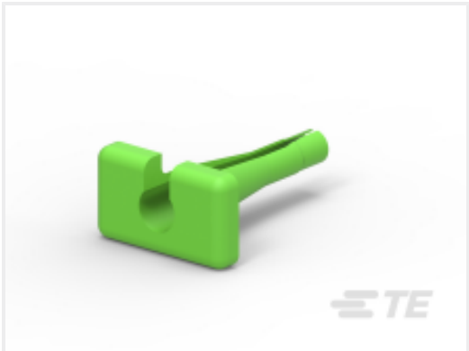
TE Part #114008-ZZ EXT TOOL, SIZE 8, 8-10 AWG, N, GRN