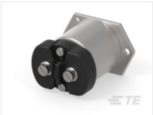
TE Part # K1060281 Relay 29-013-02