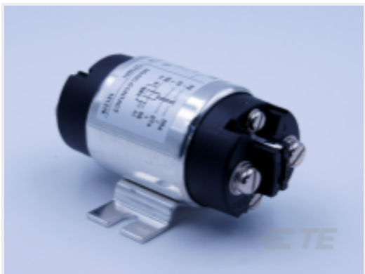
TE Part # CAT-AL6-KSPR2975 Power Relay, 75A, Standard, Monostable, DC

on SVHC in articles for this part number is based on the latest European Chemicals Agency (ECHA) ‘Guidance on requirements for substances in articles’ posted at this URL: https://echa.europa.eu/guidance-documents/guidance-on-reach