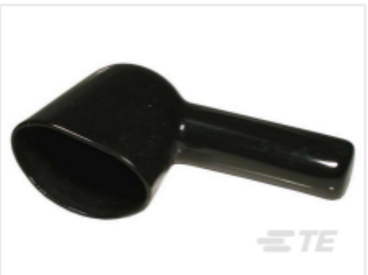
TE Part #HD30-24BT-90-BK BOOT, 24SZ, RA, BLK