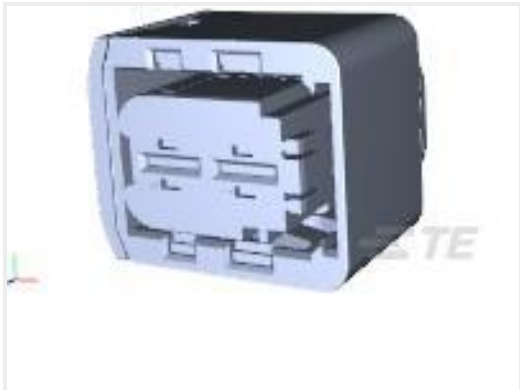
TE Part #1-1564542-1 2POS,AMP MCP6.3/4.8K,REC HSG,A