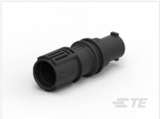
TE Part #DTSK04-1-08PB RECEPTACLE, INLINE, KEY B