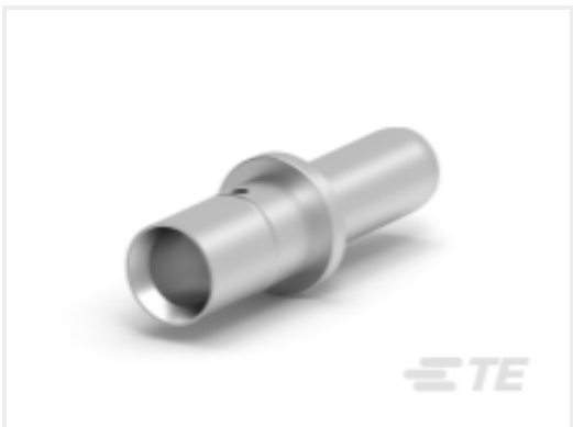
TE Part #SRK-PC-080-25-601 PIN, SOLID, SIZE M8, 25mm2, AG