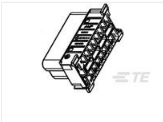
TE Part #1418984-1 MICRO TIMER 3 REC.HSG.16POS.