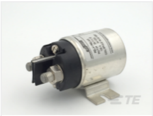
TE Part # CAT-AL6-KSPR29120 Power Relay, 120A, Standard, Monostable, DC

on SVHC in articles for this part number is based on the latest European Chemicals Agency (ECHA) ‘Guidance on requirements for substances in articles’ posted at this URL: https://echa.europa.eu/guidance-documents/guidance-on-reach