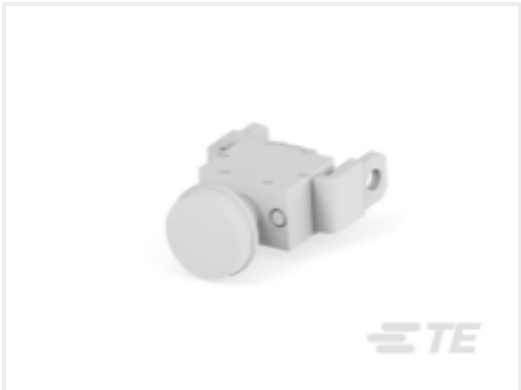
TE Part #K1138349 Emergency Power Switch Type 24-05-02