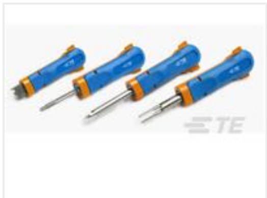
TE Part #5-1579007-5 EXTRACTION TOOL