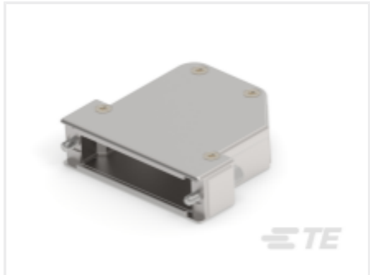
TE Part #1-2308342-1 FULL METAL HOODS SIZE 3