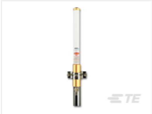
TE Part #FG24008 OMNI,FG,2400-2485MHZ 2442.5MHz, 6dBd