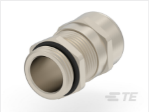
TE Part #1SNG614003R0000 EM-EMC4-M20-MET-A