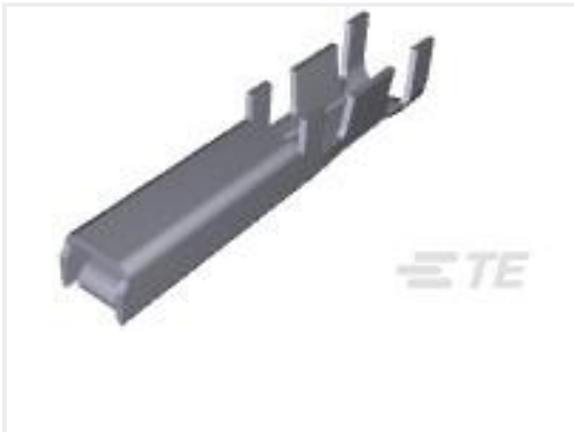
TE Part #1-917484-2 DYNAMIC D-3 REC CONT. 2L AU 0.38