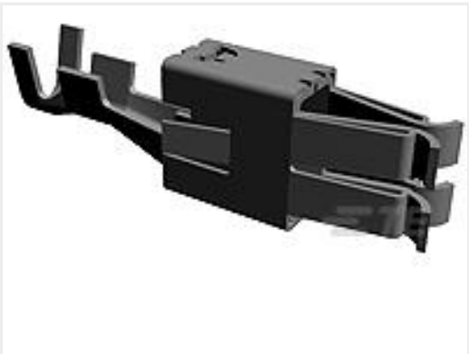
TE Part #962938-1 MPT REC 9.5 Contact SWS Sn