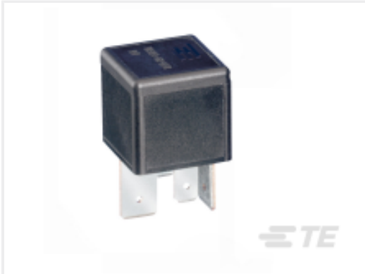
TE Part #3-1904117-4 V23134J0165X537-EV-CBOX