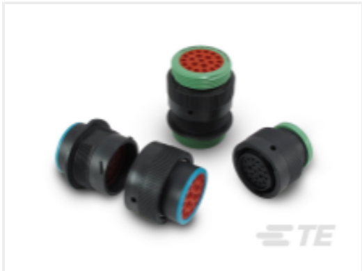
TE Part #CAT-H396-CH8172 DEUTSCH HDP20 Housings