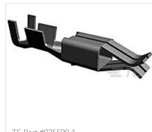
TE Part #925590-1 JPT REC 2.8 Contact SRC Sn