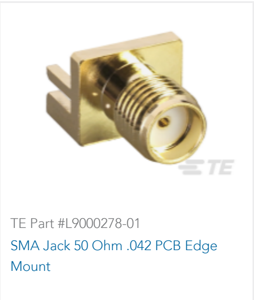
TE Part #L9000278-01 SMA Jack 50 Ohm .042 PCB Edge Mount