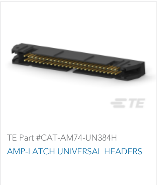
TE Part #CAT-AM74-UN384H AMP-LATCH UNIVERSAL HEADERS