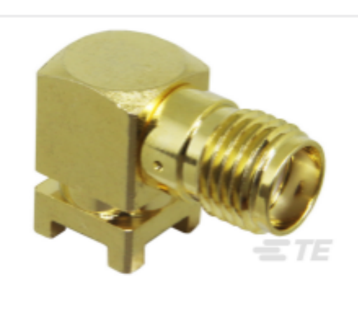
TE Part # CONSMA002-SMD-G SMA Jack 50 Ohm PCB Surface Mount