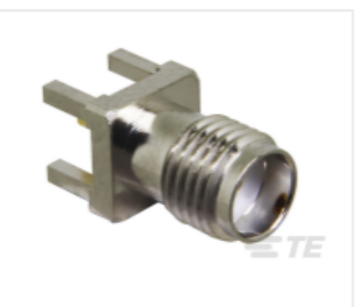
TE Part # CONSMA001 SMA Jack 50 Ohm PCB Through Hole