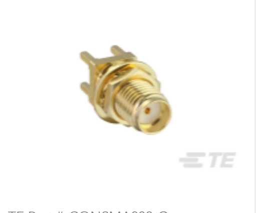
TE Part # CONSMA008-G SMA Jack 50 Ohm Through Hole PCB