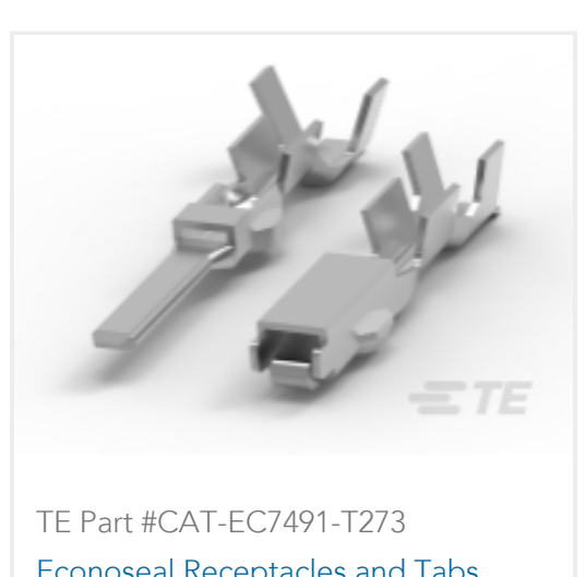
Econoseal Receptacles and Tabs