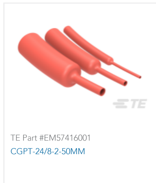
TE Part #EM57416001 CGPT-24/8-2-50MM