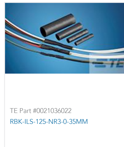
TE Part #0021036022 RBK-ILS-125-NR3-0-35MM