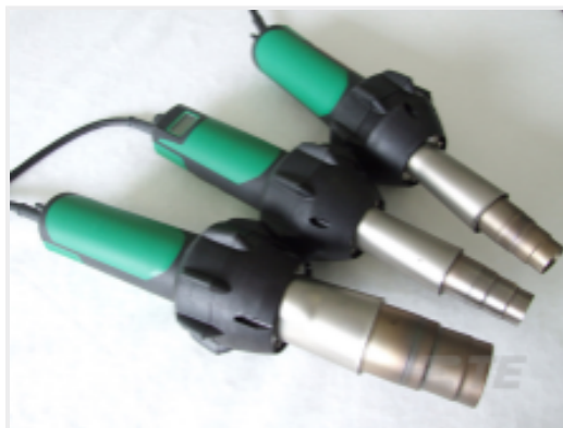
TE Part # EG1114-000 CV1981-ST-230V1600W-EU