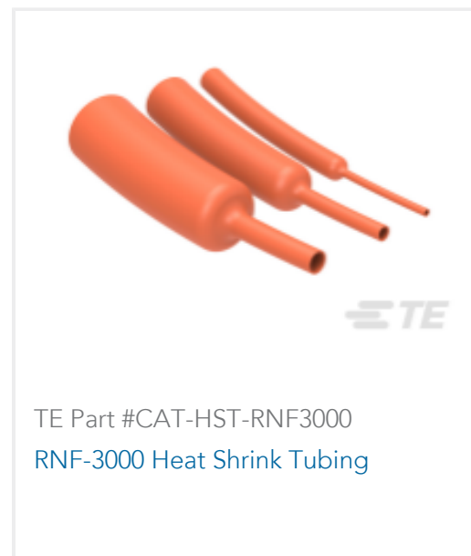
TE Part #CAT-HST-RNF3000 RNF-3000 Heat Shrink Tubing