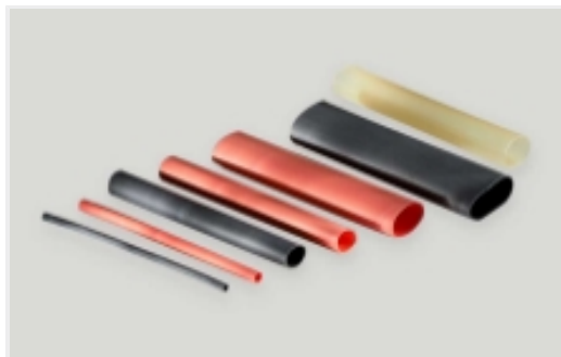
Dual Wall Tubing(66)