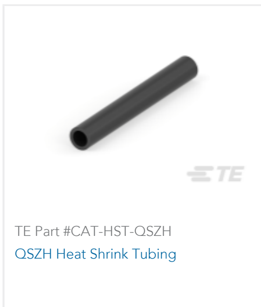
TE Part #CAT-HST-QSZH QSZH Heat Shrink Tubing