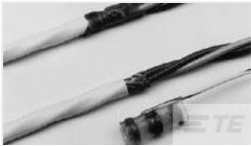
TE Part #073170-000 SO63-1-00