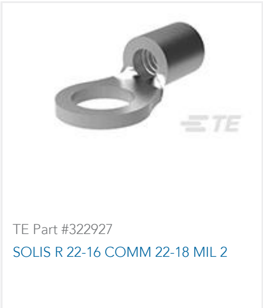
TE Part #322927 SOLIS R 22-16 COMM 22-18 MIL 2