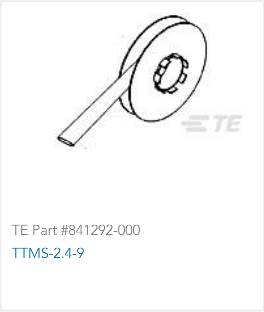
TE Part #841292-000 TTMS-2.4-9