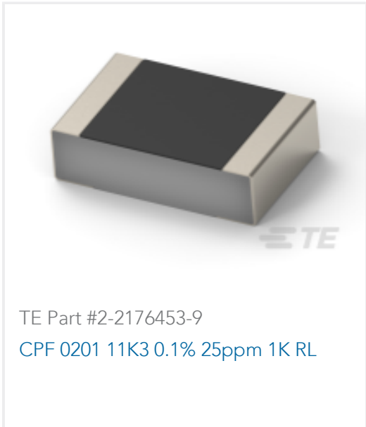
TE Part #2-2176453-9 CPF 0201 11K3 0.1% 25ppm 1K RL