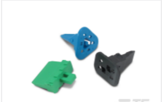
TE Part #CAT-D487-W416 Wedgelocks: DEUTSCH DT