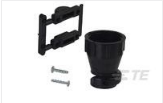
TE Part #206070-8 CABLE CLAMP KIT #17