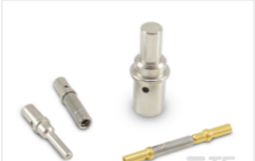
TE Part #CAT-D48-ST273 DEUTSCH Solid Contacts