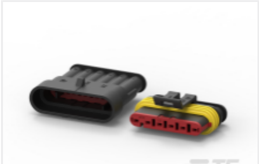
TE Part #CAT-AM71-CH8172 AMP SUPERSEAL 1.5MM, CONNECTOR HOUSING