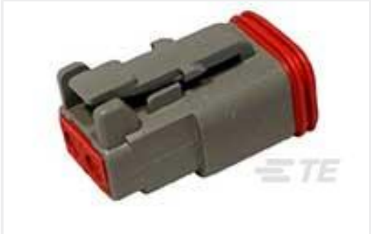
TE Part #DT06-2S PLG, 2P, GRY, N