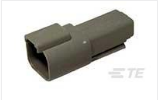
TE Part #DT04-2P REC, 2P, GRY, N