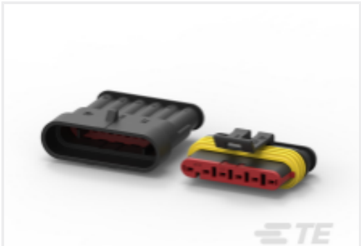
TE Part #CAT-AM71-CH8172 AMP SUPERSEAL 1.5MM, CONNECTOR HOUSING