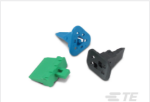
TE Part #CAT-D487-W416 Wedgelocks: DEUTSCH DT