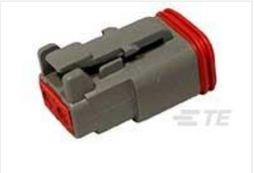
TE Part #DT06-2S PLG, 2P, GRY, N