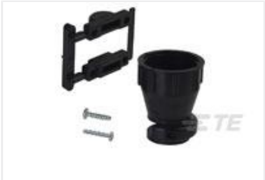
TE Part #206070-8 CABLE CLAMP KIT #17