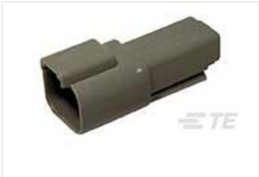
TE Part #DT04-2P REC, 2P, GRY, N