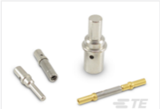
TE Part #CAT-D48-ST273 DEUTSCH Solid Contacts