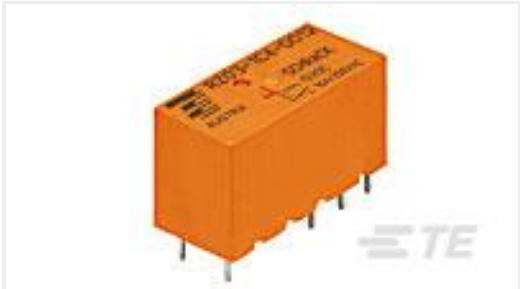
TE Part #2-1415899-3 RZ03-1C4-D024