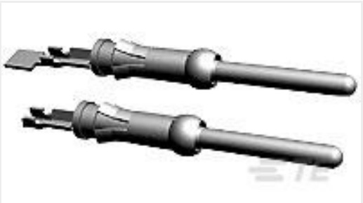
TE Part #1-66361-4 III+ PIN,18-14,30AU/FL,LP