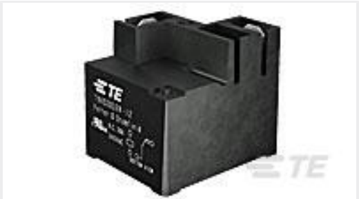
TE Part #5-1419102-2 T9AP5D52-24