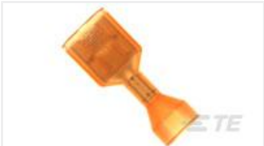
TE Part #2-520264-2 ULTRAFAST 250 ASSY REC 22-18 TPBR LP