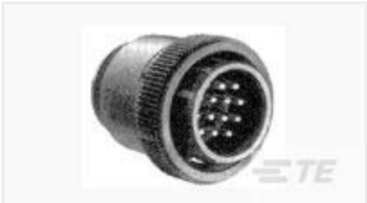
TE Part #206429-1 CPC PLUG ASSY, 11-4, REV SEX