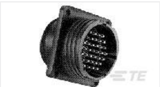
TE Part #206705-1 CPC RECP. ASY SIZE 13-9