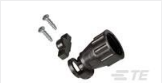
TE Part #1-206062-4 CABLE CLAMP KIT #11