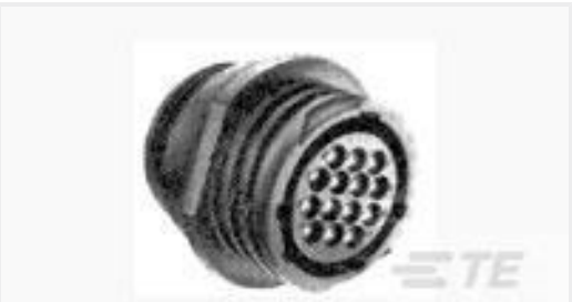
TE Part #206430-2 CPC 11-4 Free Hanging Receptacle