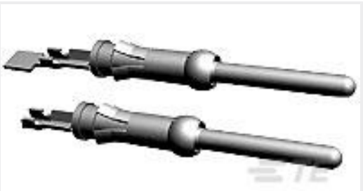
TE Part #1-66099-5 III+ PIN,18-16,TIN ,LP