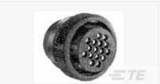
TE Part #206060-1 CPC PLUG ASSEMBLY SIZE 11-4