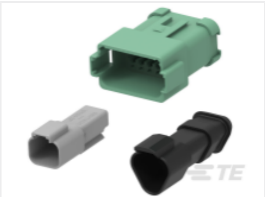
TE Part #CAT-J41-DDRC DEUTSCH DT Receptacle Connectors