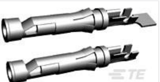
TE Part #1-66101-9 III+ SKT,18-16,TIN ,LP