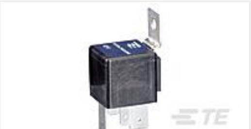
TE Part #1393304-9 V23134J1052D642-EV-CBOX