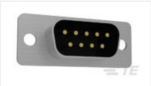
TE Part #5-747904-2 9 Plug Solder Cup, Gold Flash,