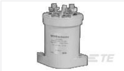
TE Part #5-1618388-5 LEV200H5ANA=RELAY, SPST-NO