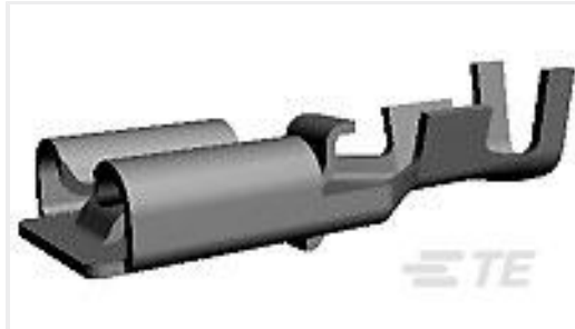
TE Part #179974-1 250 PL EX REC. 18-14AWG PTBR