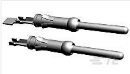
TE Part #66103-3 III+ PIN,24-20,15AU/FL,LP