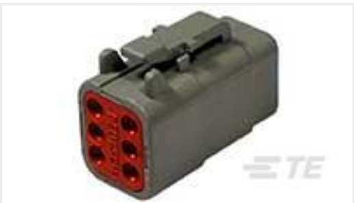
TE Part #DTM06-6S PLG, 6P, GRY, N