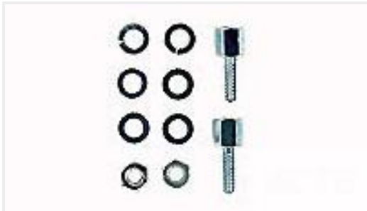
TE Part #5207719-3 KIT SCREWLOCK FEMALE CLEAR ZIN