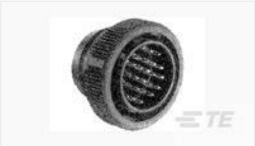
TE Part #206039-1 CPC PLUG ASSEMBLY SIZE 17-28