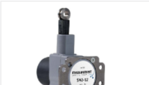
TE Part #SM2-7 STRING POT, 7.5 INCH RANGE