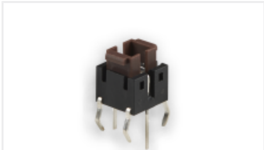
TE Part #2-2213818-6 6X6 ILL TACT THT 160GF HI PURE GREEN