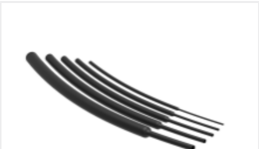
TE Part #EL88852001 VERSAFIT-1/8-0-STK