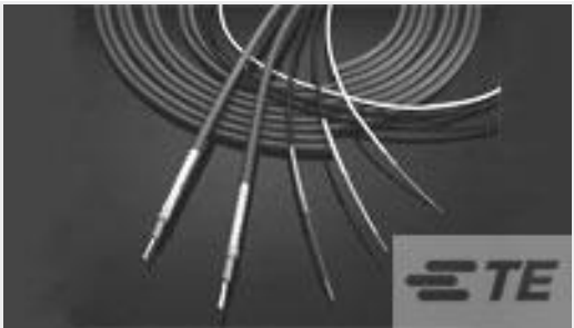
TE Part #CJ0689-000 0026C0024-9X