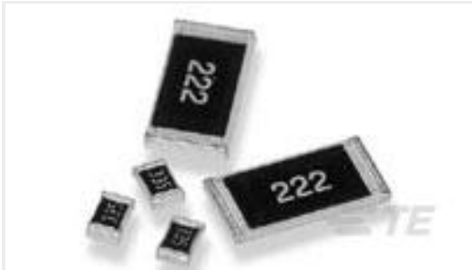
TE Part #9-1879512-6 CRGH0805 1% 120R 0.33W