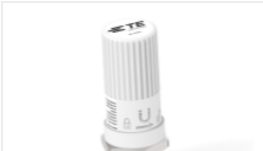
TE Part #20026680-54 6511N-NX BLE Abs 350Bar NPT w /battery