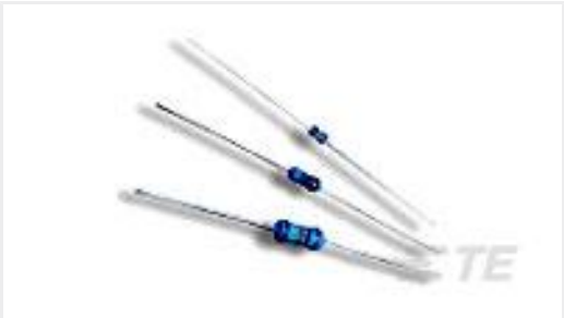
TE Part #1622364-1 LR1 1% 1K8