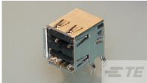
TE Part #5787745-2 USB A R/A STAK ASSY THRU HOLE