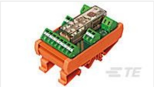
TE Part #5-1415033-1 SR6ZB024