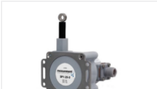
TE Part #SP1-4 STRING POT 4.75 INCH RANGE