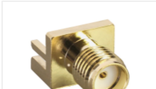
TE Part #L9000278-01 SMA Jack 50 Ohm .042 PCB Edge Mount