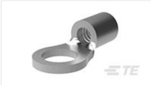
TE Part #34108 SOLIS R 22-16 COMM 22-18 MIL 8