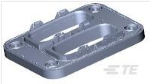
TE Part #1813123-1 ASSY FOR SUPPORT PLATE AND SEALING