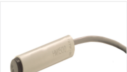
TE Part #HPP805A031 HM1500LF HUMIDITY MODULE