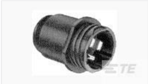
TE Part #206207-1 17-3 RECEPT. FREE-HANGING