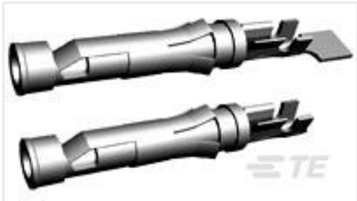
TE Part #2-66104-3 III+ SKT,24-20,30AU/FL,STRIP