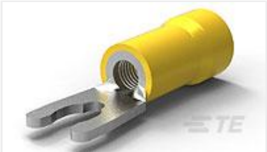
TE Part #53247-2 TERMINAL,PG SPR SPD 12-10 8