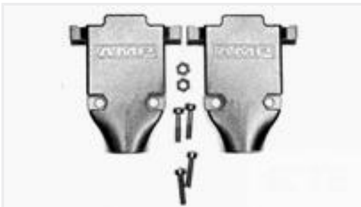
TE Part #5745854-5 CABLE CLAMP KIT,SZ 1