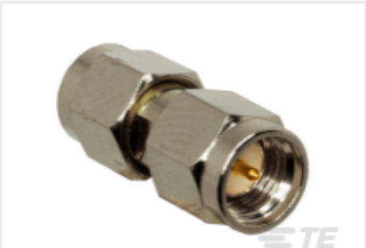
TE Part #ADP-SMAM-SMAM SMA Plug to SMA Plug