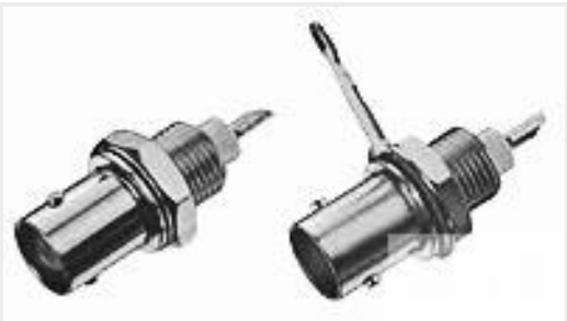
TE Part #5227754-3 BNC SOLDER RECEPT JACK