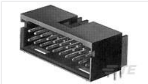
TE Part #5-102570-8 20 MODII HDR DRRA SHRD LF