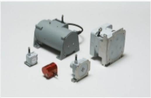
Cable Actuated Position Sensors(23)