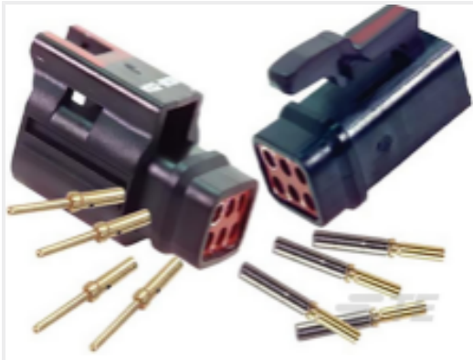
TE Part #ASC105-06SN RECEPT.AS MODULAR. SKT.