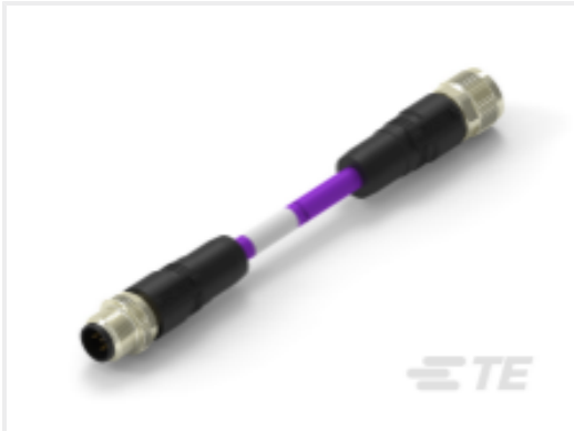
TE Part #TAA755A5501-080 M12A5-MS-FS-PUR-8.0M