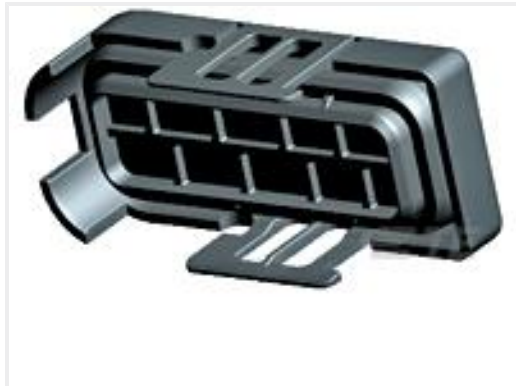
TE Part #2112297-1 PROTECTION CAP,GROUP E,ASSY DT, A