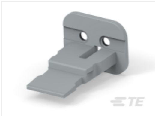
TE Part #W2SA WEDGE LOCK, 2P, PLG, GRY, STD, DT, A