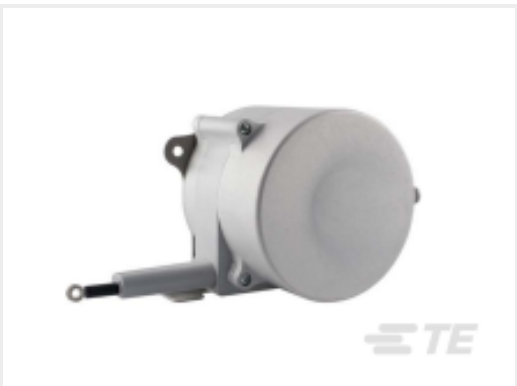
TE Part #CAT-CAPS0074 IP67 String Pots, 4-20Ma Output, SR1M