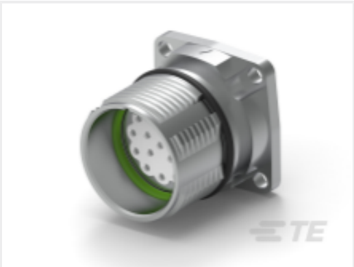
TE Part #AEA577N00000201000 623 RECEPTACLE, SPEEDTEC-READY