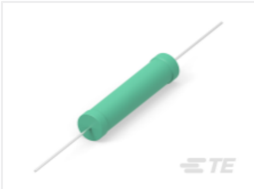
TE Part #1-2176614-4 EP 10W (SS) 3R6 5% BULK BOX