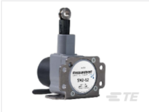
TE Part #SM2-25 STRING POT, 25 INCH RANGE