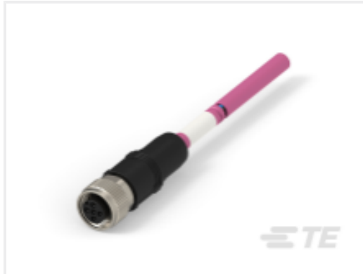
TE Part #TAA753A5501-040 M12A5-FS-PUR-4.0M