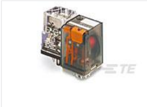
TE Part #3-1393104-2 KRPA-11AN-120=KRPA