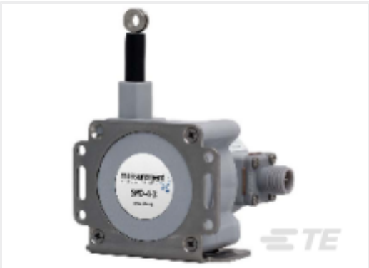
TE Part #SPD-50-3 STRING POT 50 INCH RANGE