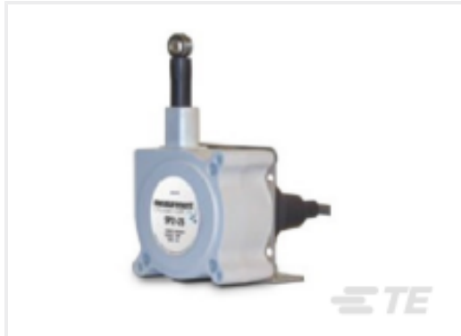
TE Part #SP2-50 STRING POT 50 INCH RANGE