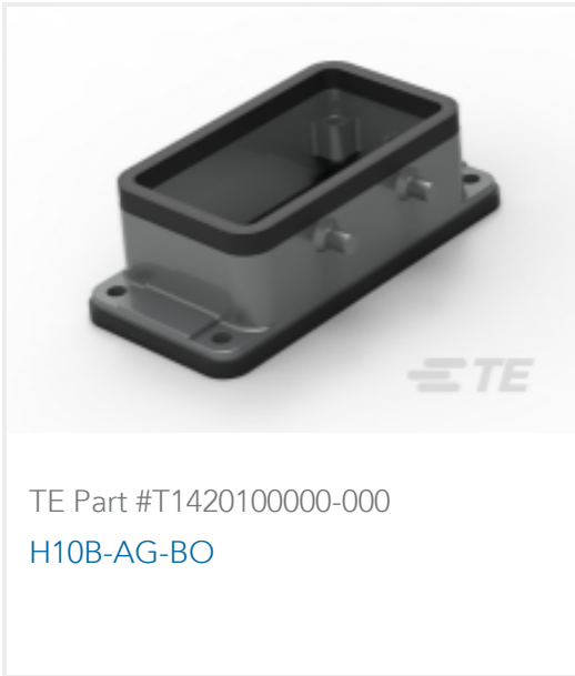
TE Part #T1420100000-000 H10B-AG-BO