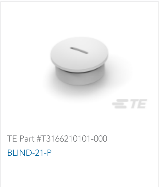
TE Part #T3166210101-000 BLIND-21-P