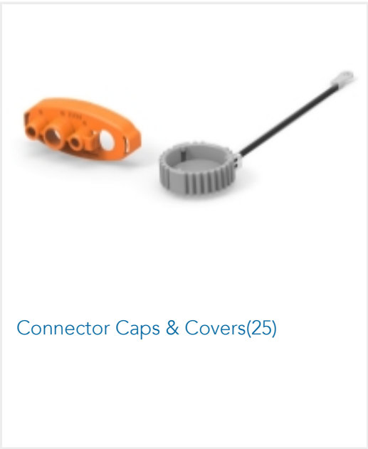
Connector Caps & Covers(25)