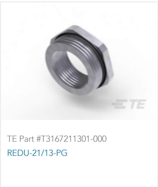
TE Part #T3167211301-000 REDU-21/13-PG