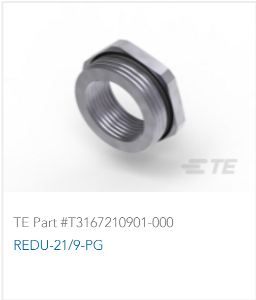
TE Part #T3167210901-000 REDU-21/9-PG