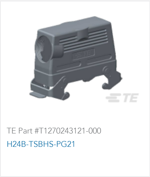
TE Part #T1270243121-000 H24B-TSBHS-PG21