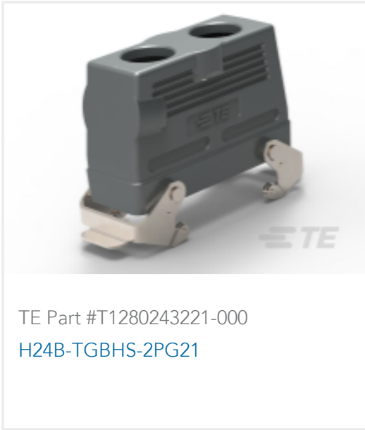
TE Part #T1280243221-000 H24B-TGBHS-2PG21