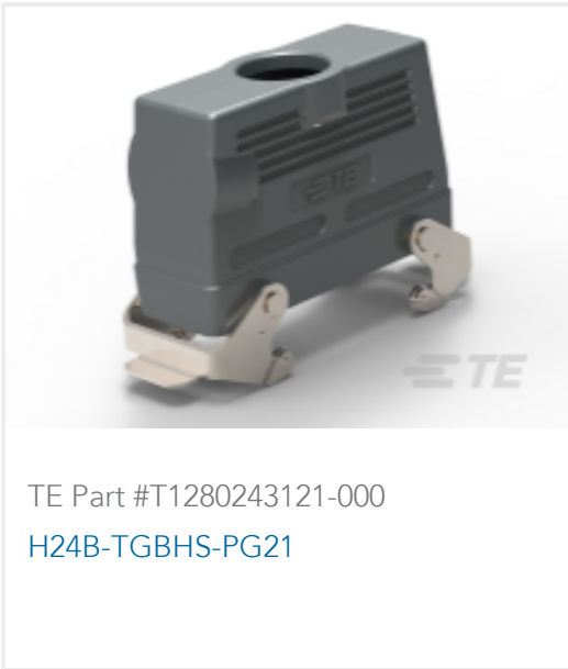
TE Part #T1280243121-000 H24B-TGBHS-PG21