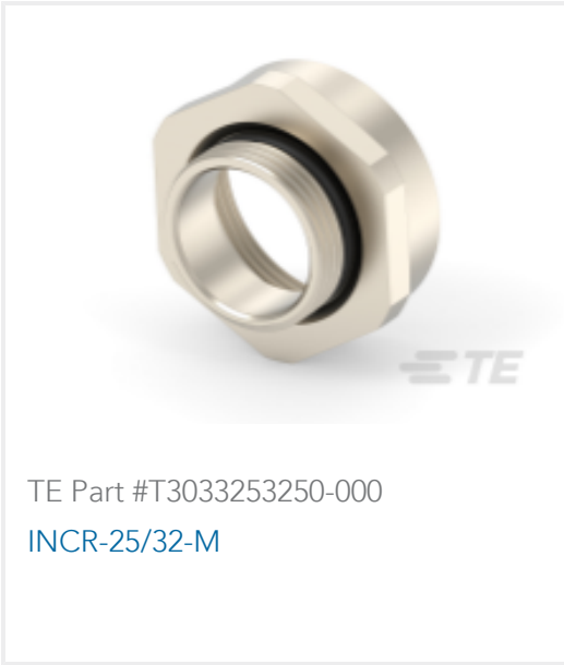
TE Part #T3033253250-000 INCR-25/32-M