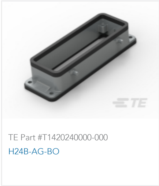
TE Part #T1420240000-000 H24B-AG-BO