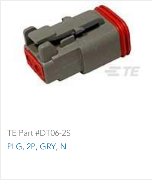
TE Part #DT06-2S PLG, 2P, GRY, N