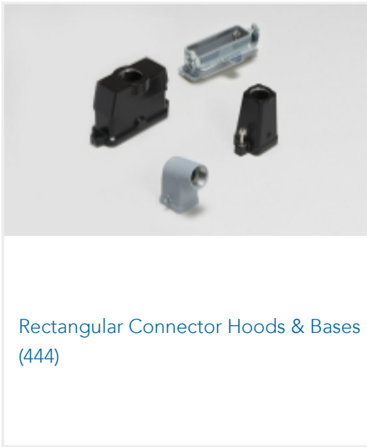
Rectangular Connector Hoods & Bases (444)