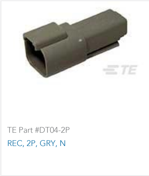
TE Part #DT04-2P REC, 2P, GRY, N