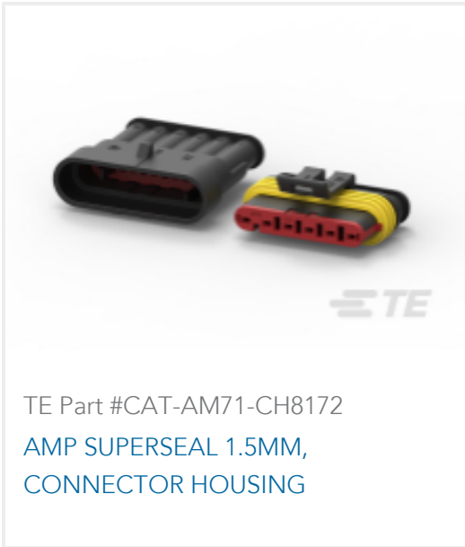
TE Part #CAT-AM71-CH8172 AMP SUPERSEAL 1.5MM, CONNECTOR HOUSING