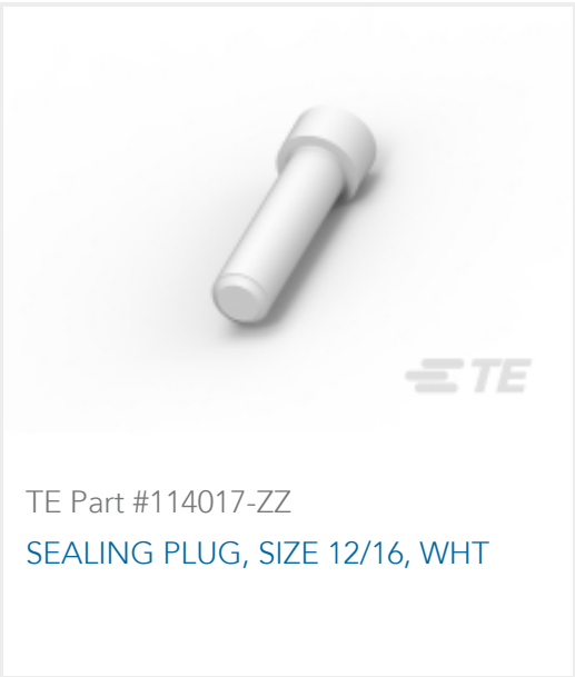
TE Part #114017-ZZ SEALING PLUG, SIZE 12/16, WHT