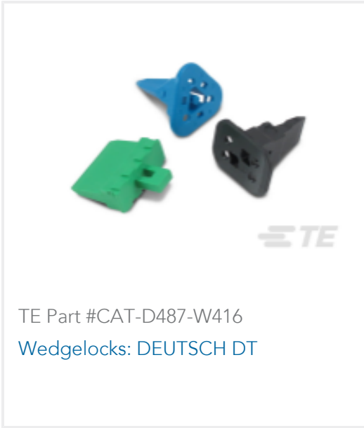
TE Part #CAT-D487-W416 Wedgelocks: DEUTSCH DT