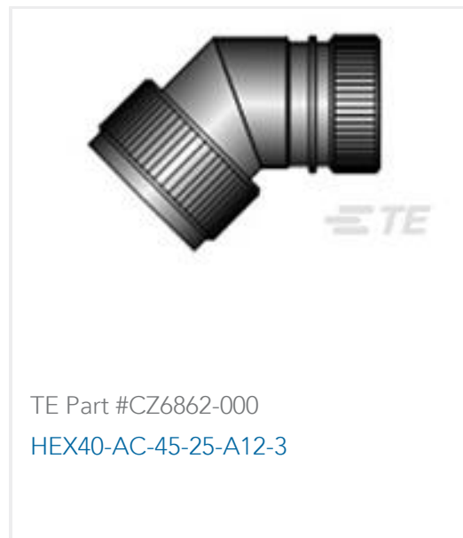
TE Part #CZ6862-000 HEX40-AC-45-25-A12-3