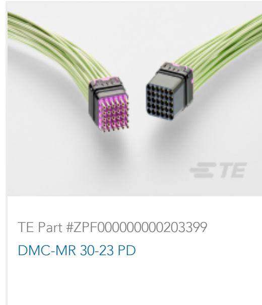
TE Part #ZPF00000000203399 DMC-MR 30-23 PD