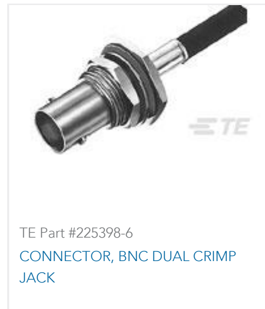
TE Part #225398-6 CONNECTOR, BNC DUAL CRIMP JACK