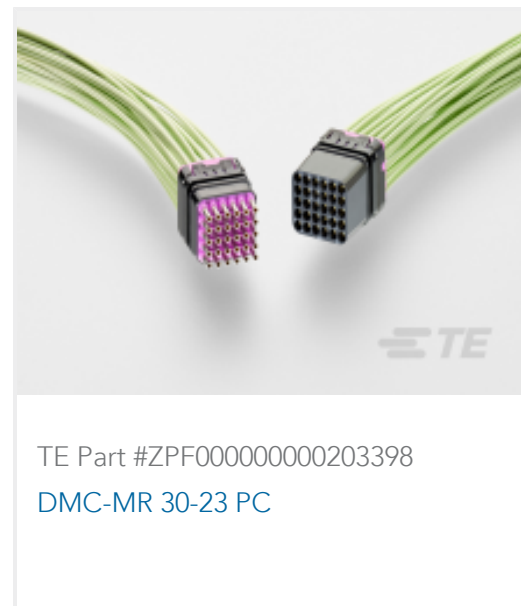
TE Part #ZPF00000000203398 DMC-MR 30-23 PC