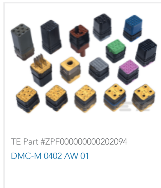
TE Part #ZPF00000000202094 DMC-M 0402 AW 01