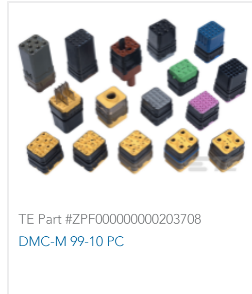
TE Part #ZPF00000000203708 DMC-M 99-10 PC