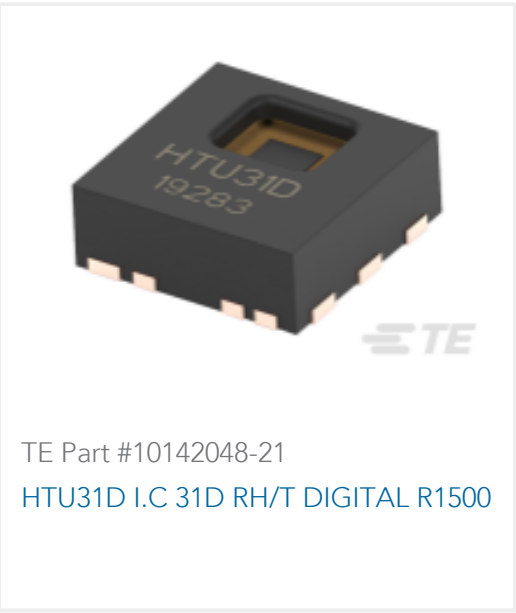
TE Part #10142048-21 HTU31D I.C 31D RH/T DIGITAL R1500