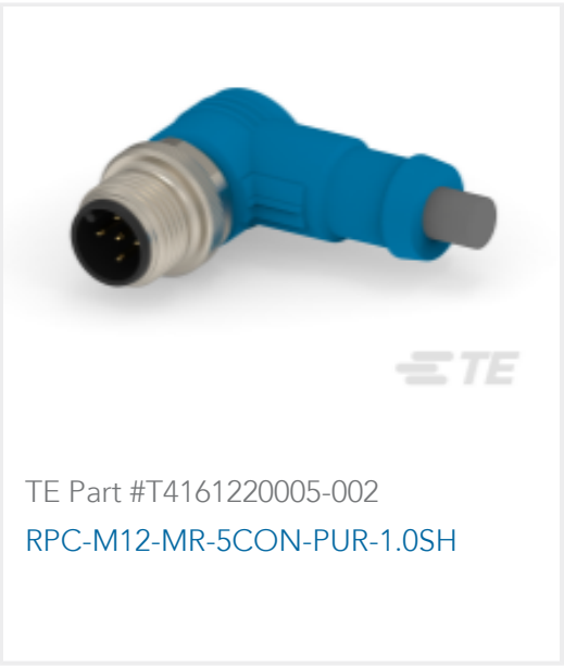
TE Part #T4161220005-002 RPC-M12-MR-5CON-PUR-1.0SH