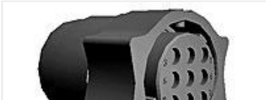
TE Part #1445819-1 PLUG,11-6,SM INS,STD KEY