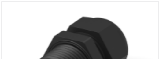
TE Part #1SNG601162R0000 EP-SG-NPT12-BL-B