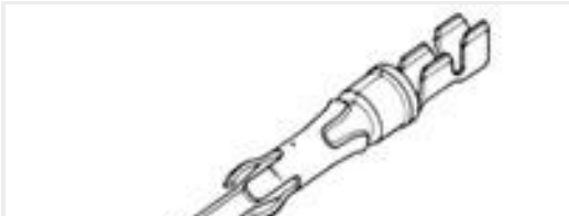
TE Part #164164-1 PIN ASS