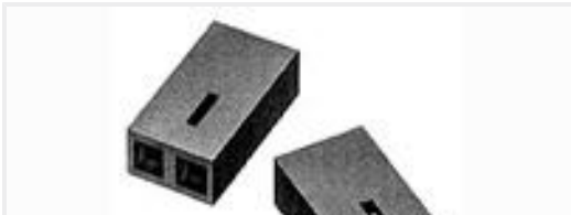
TE Part #390088-2 BLACK HSG WITH 15AU CONTACT