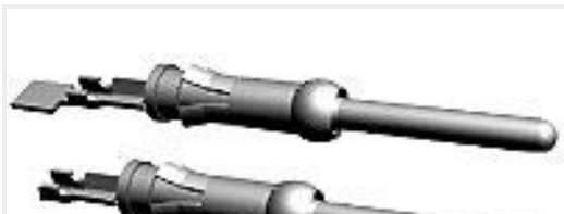
TE Part #66106-7 III+ PIN,26-24,15AU/FL,STRIP