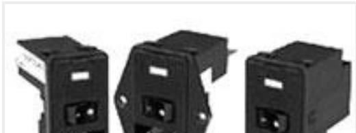
TE Part #7-6609107-2 PS0S0DS6B=C1185