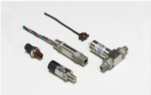
Industrial Pressure Transducers(5)