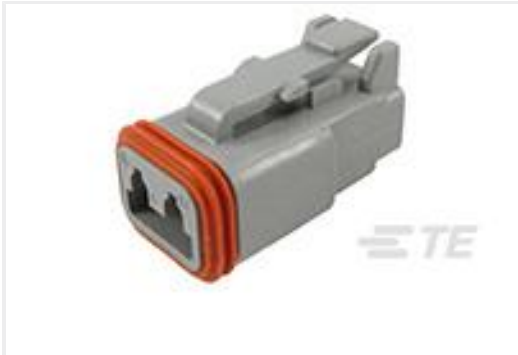
TE Part #DT06-2S-C015 PLG, 2P, GRY, E