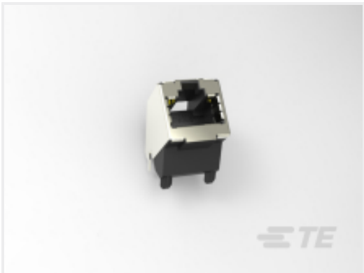
TE Part #2170668-1 ANGLED ENTRY JACK, SHIELDED RJ45