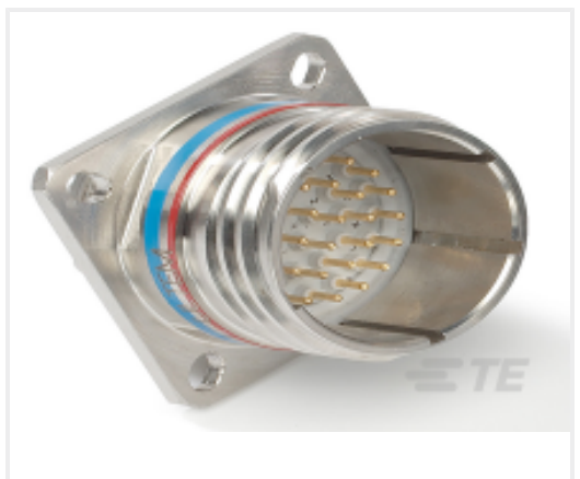
TE Part # CAT-D38999-DTS6O D38999: Square Flange, 15-35 insert