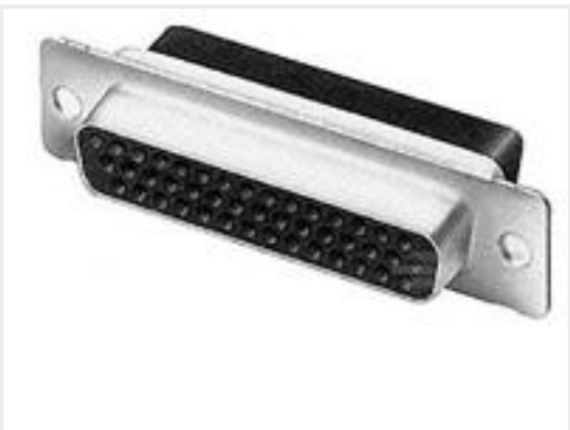
TE Part #1658682-1 HDP-22,RCPT,SIZE 2,26 POSN