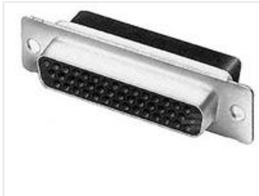
TE Part #1658681-1 HDP-22,RCPT,SIZE 1,15 POSN