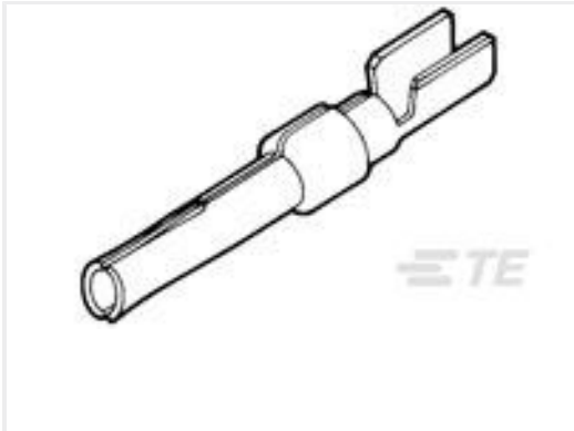
TE Part #745230-4 20 DF SOCKET CONTACT L.P.