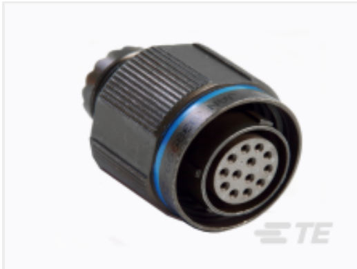
TE Part #YDTS26W09-98SNV001 PLUG ASSY