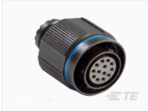
TE Part #YDTS26W13-35SNV001 PLUG ASSY