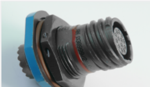
TE Part #YDTS24W15-19PNV001 RECP ASSY