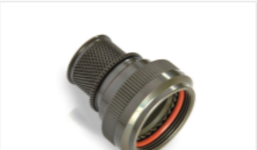
TE Part #EK4827-000 91H1-11-06-1-B-HE100