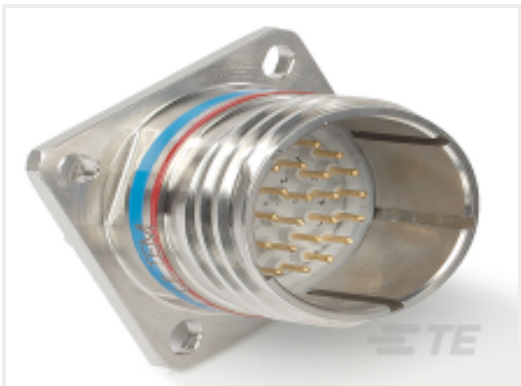
TE Part # CAT-D38999-DTS7K D38999: Square Flange, 25-61 insert