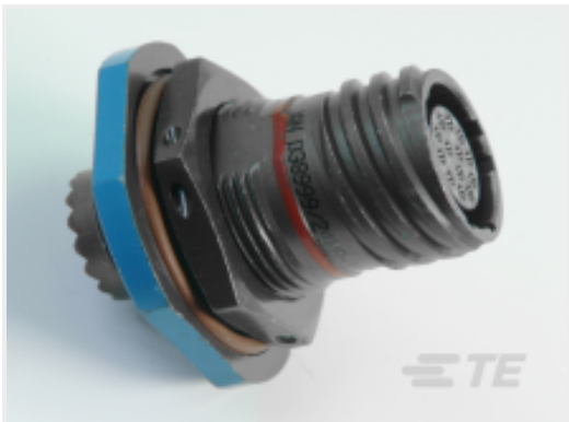
TE Part # CAT-D38999-DTS16K Jam Nut: D38999, 25-61 Insert

This information is provided based on reasonable inquiry of our suppliers and represents our current actual knowledge based on the information they provided. This information is subject to change. The part numbers that TE has identified as EU RoHS compliant have a maximum concentration of 0.1% by weight in homogenous materials for lead, hexavalent chromium, mercury, PBB, PBDE, DBP, BBP, DEHP, DIBP, and 0.01% for cadmium, or qualify for an exemption to these limits as defined in the Annexes of Directive 2011/65/EU (RoHS2). Finished electrical and electronic equipment products will be CE marked as required by Directive 2011/65/EU. Components may not be CE marked. Additionally, the part numbers that TE has identified as EU ELV compliant have a maximum concentration of 0.1% by weight in homogenous materials for lead, hexavalent chromium, and mercury, and 0.01% for cadmium, or qualify for an exemption to these limits as defined in the Annexes of Directive 2000/53/EC (ELV). Regarding the REACH Regulation, the information TE provides on SVHC in articles for this part number is based on the latest European Chemicals Agency (ECHA) 'Guidance on requirements for substances in articles' posted at this URL: https://echa.europa.eu/guidance-documents/guidance-on-reach