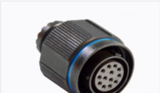
TE Part #YDTS26W17-26PAV001 PLUG ASSY