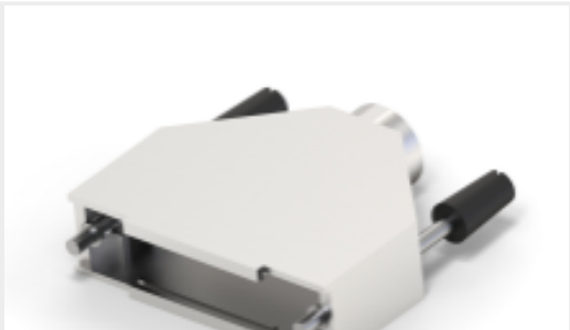
TE Part #6-1478762-7 METAL BACKSHELL 25 WAY TOP ENTRY