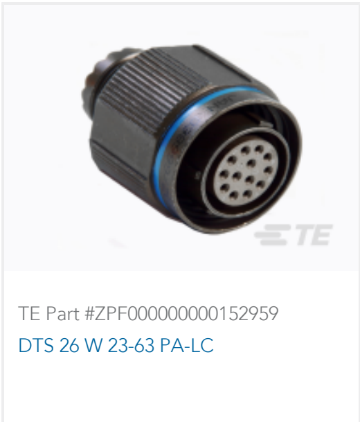
TE Part #ZPF000000000152959 DTS 26 W 23-63 PA-LC