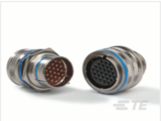
TE Part #ZPF000000000100021 DBAS 78-61-0 SN 1A